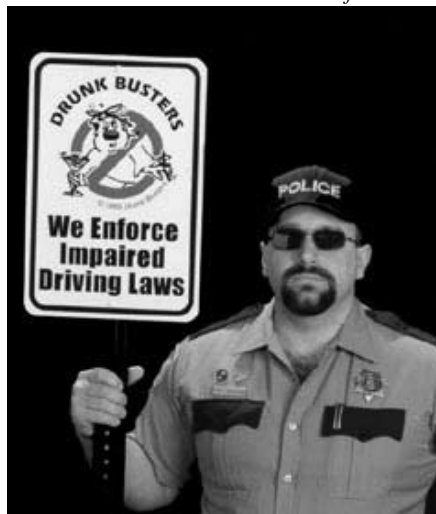
Drunk Busters of America

Although police want to create the impression that all drunk drivers will be arrested, in reality only a small percentage of drunk drivers on the road at any particular time will in fact be stopped or arrested.